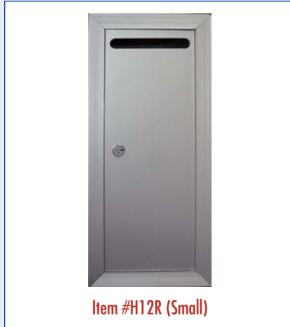
Item #H12R (Small)