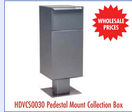
HDVCS0030 Pedestal Mount Collection Box