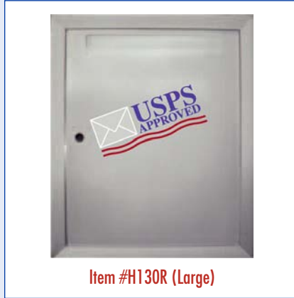
Item #H130R (Large)