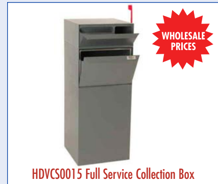
HDVCS0015 Full Service Collection Box