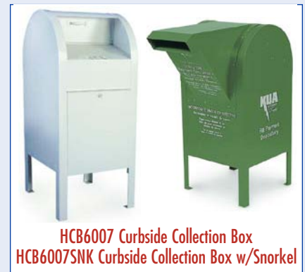
HCB6007 Curbside Collection Box HCB6007SNK Curbside Collection Box w/Snorkel