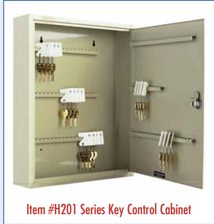
Item #H201 Series Key Control Cabinet