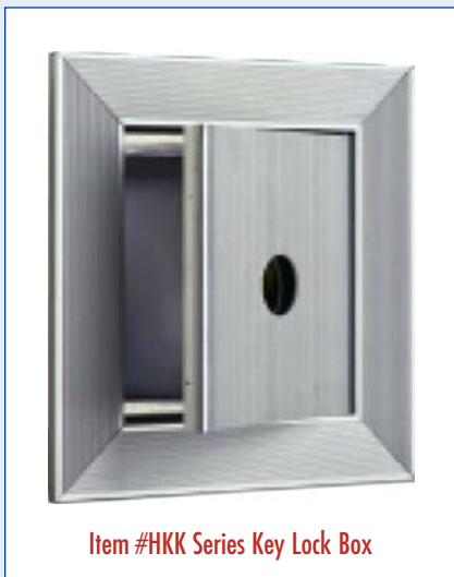
Item #HKK Series Key Lock Box

Order by Phone: 1-800-676-5161 • Order by Fax: (414) 258-6820 info@nationalmailboxes.com • Website: www.NationalMailboxes.com