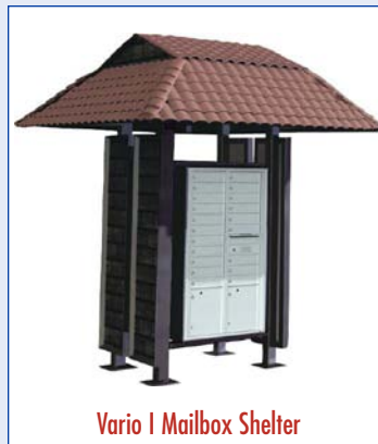
Vario I Mailbox Shelter