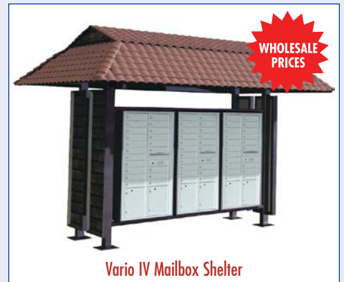
Vario IV Mailbox Shelter