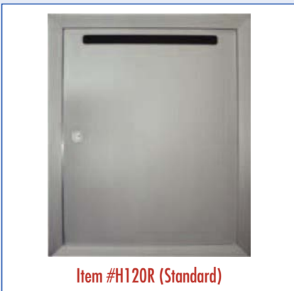
Item #H120R (Standard)