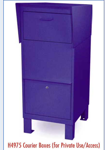
H4975 Courier Boxes (for Private Use/Access)