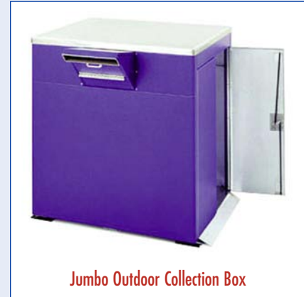
Jumbo Outdoor Collection Box