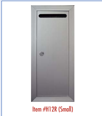
Item #H12R (Small)