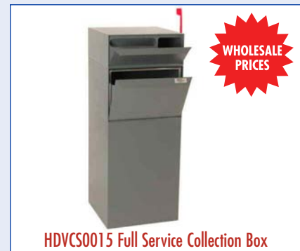
HDVCS0015 Full Service Collection Box