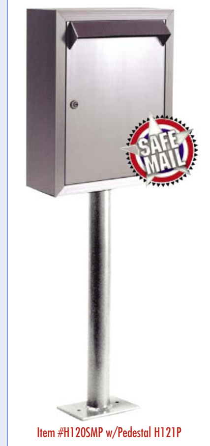
Item #H120SMP w/Pedestal H121P