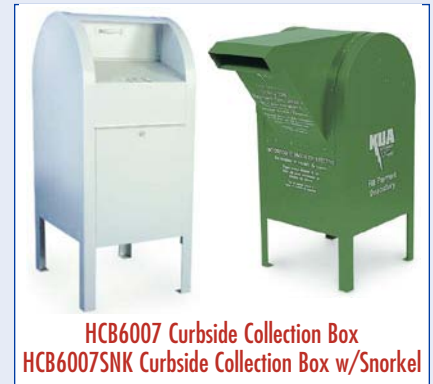
HCB6007 Curbside Collection Box HCB6007SNK Curbside Collection Box w/Snorkel