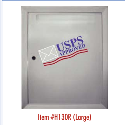
Item #H130R (Large)