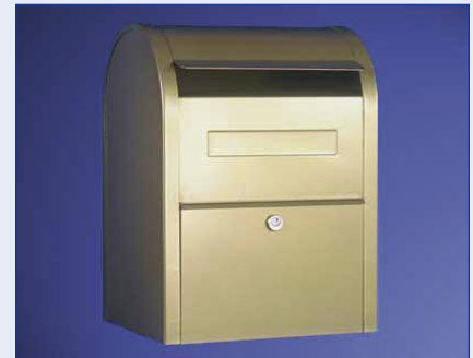
Item #HCB6006 Mini Collection Box