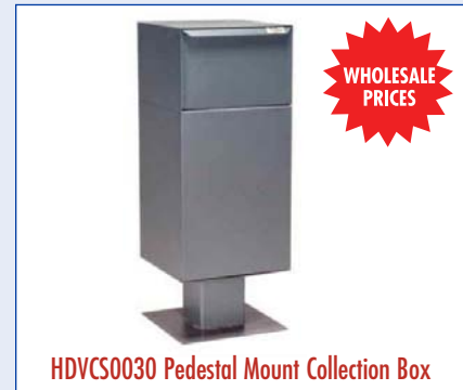
HDVCS0030 Pedestal Mount Collection Box