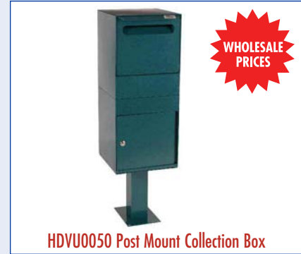
HDVU0050 Post Mount Collection Box